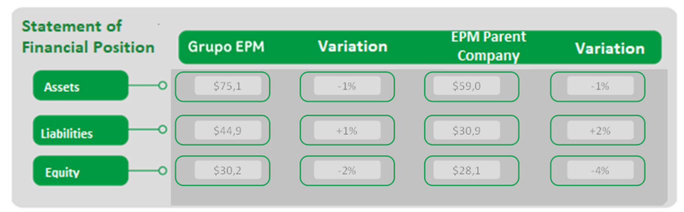
Figures in COP Billion